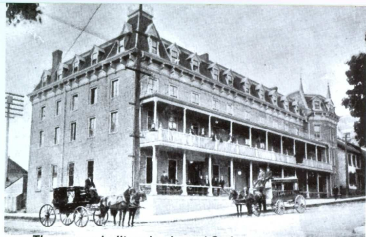
The new re-built and enlarged St. Lawrence Hall as it appeared about 1895, following the disastrous fire of 1883.