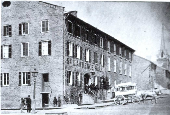
This is the earliest known photograph of the St. Lawrence Hall as it looked in the 1860s